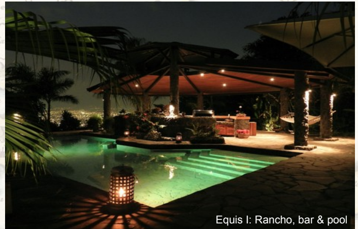
Equis I: Rancho, bar & pool

However, there are many more adventures waiting for you on your round trip. San José is just the first stop.