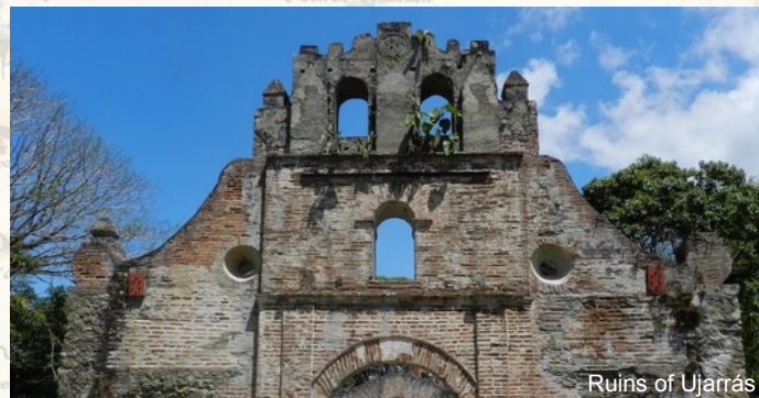
Ruins of Ujarrás

Please ask us about the restaurants, we would be happy to share our experiences with you.