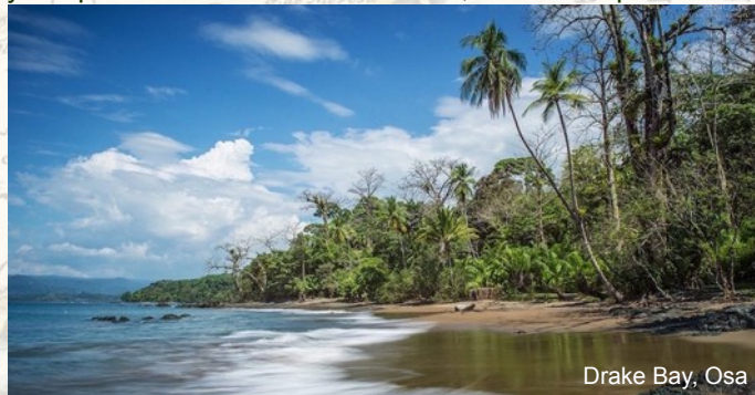
Drake Bay, Osa

The Península de Osa is still very original. There are only a