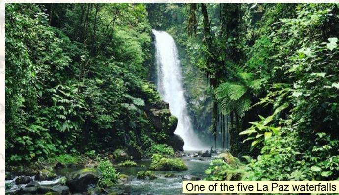
One of the five La Paz waterfalls

Do you like fly fishing? Perfect! You are in the right place.