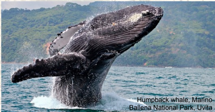
Humpback whale, Marino Ballena National Park, Uvita

If you wish, book a whale watching tour at the hotel or simply gaze out over the Pacific Ocean, perhaps over a cocktail.