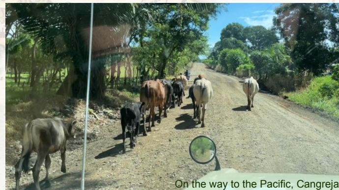
On the way to the Pacific, Cangrejal