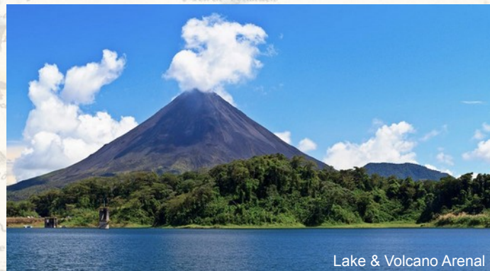
Lake & Volcano Arenal

The water temperatures in the individual pools are between 28°C and 40°C - look forward to an unforgettable bathing experience with a spectacular view of the Arenal Volcano. www.thespringscostarica.com