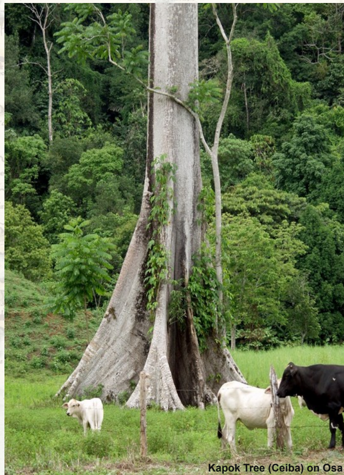
Kapok Tree (Ceiba) on Osa

This allows you to choose an appointment that fits perfectly into your schedule.