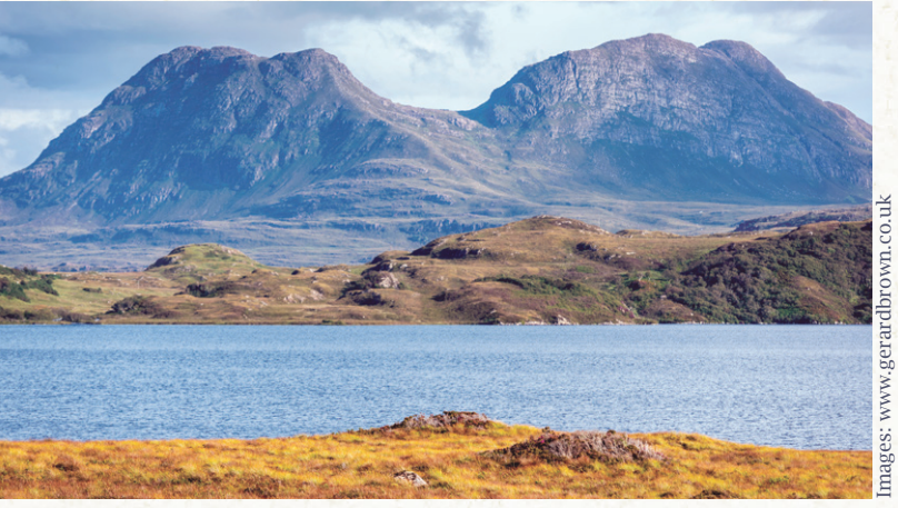
Subject to change